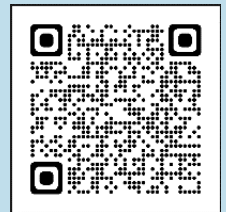
QR code to the City Manager's Office Team and contact info